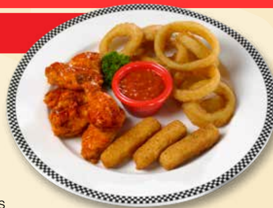
Johnny's Combo #1

CHICKEN CAESAR SALAD 15.99 Grilled chicken breast, sliced & served on crisp romaine lettuce tossed in our classic Caesar dressing with real bacon bits, Parmesan cheese & seasoned crunchy croutons