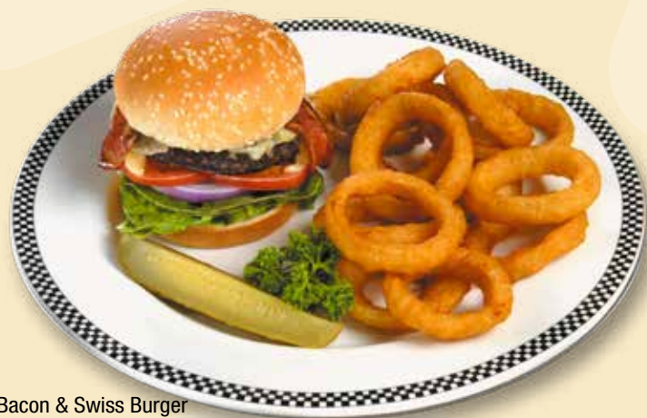
Bacon & Swiss Burger

DELUXE BURGER 17.99 Cheddar cheese, Canadian back bacon, lettuce, tomato & red onions