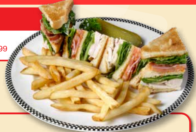
Johnny's Club House

CHICKEN & AVOCADO CLUB 19.99 Grilled chicken breast, bacon, fresh avocado, lettuce, tomato & mayo