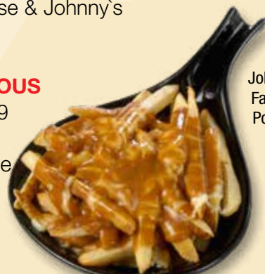
Johnny's Famous Poutine

JOHNNY'S FAMOUS POUTINE 12.99 Golden fries, St. Albert's cheese curds & Johnny's famous gravy