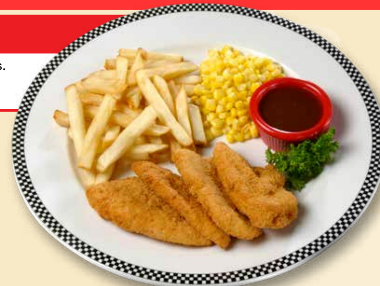
Classic Chicken Fingers