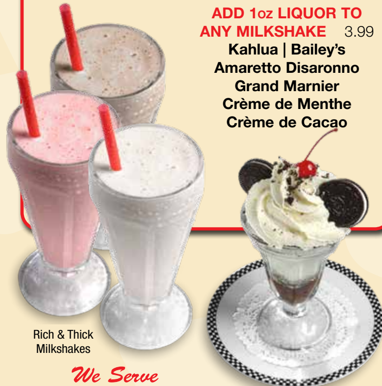
Rich & Thick Milkshakes

Kahlua | Bailey's Amaretto Disaronno Grand Marnier Crème de Menthe Crème de Cacao