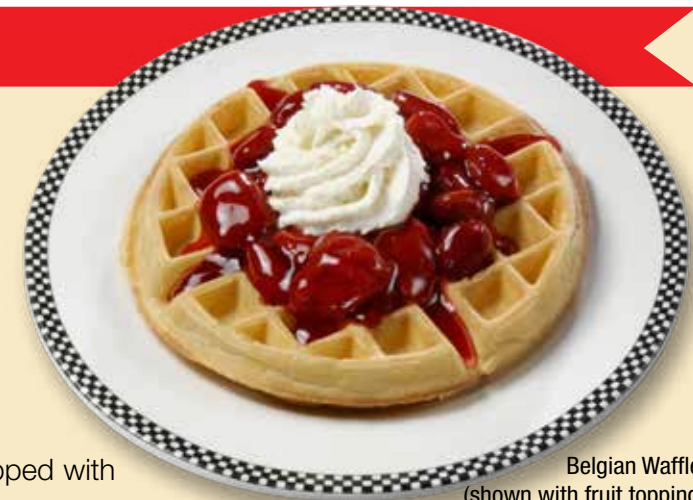
Belgian Waffle (shown with fruit topping)

BANANA SPLIT WAFFLE 16.99 Our golden Belgian waffle topped with sliced bananas, strawberry topping, pineapples & a scoop of vanilla ice cream. Finished with chocolate sauce & whipped cream