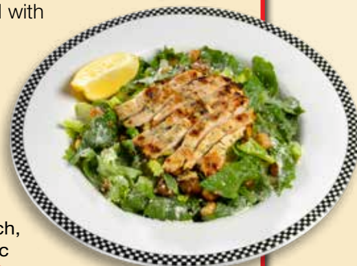
Chicken Caesar Salad

Dressings Available: Creamy Garlic, Italian, Ranch, Thousand Island & Balsamic Add grilled chicken breast 4.99 Add smoked Salmon 5.99