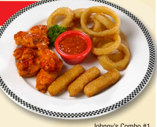
Johnny's Combo #1

Our classic golden fingers tossed with mild, medium or hot wing sauce. Served with ranch sauce