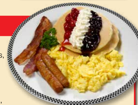
Johnny's Deluxe Combo

JOHNNY'S DELUXE COMBO 15.99 Two pancakes or two French toast, two eggs, two bacon strips & two sausage links. Pancakes or French toast topped with choice of two fruit toppings & whipped cream