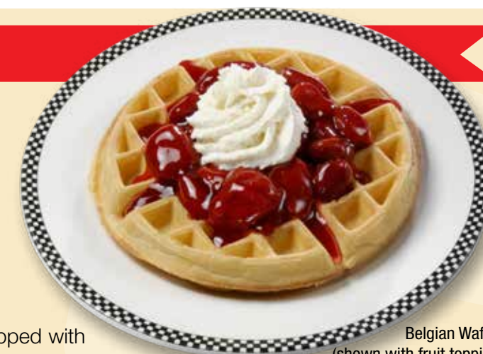
Belgian Waffle (shown with fruit topping)

BANANA SPLIT WAFFLE 15.99 Our golden Belgian waffle topped with sliced bananas, strawberry topping, pineapples & a scoop of vanilla ice cream. Finished with chocolate sauce & whipped cream