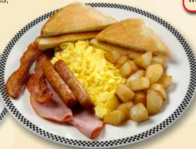
Big Man Breakfast