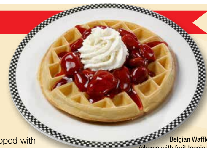
Belgian Waffle (shown with fruit topping)

Our golden Belgian waffle topped with sliced bananas, strawberry topping, pineapples & a scoop of vanilla ice cream. Finished with chocolate sauce & whipped cream