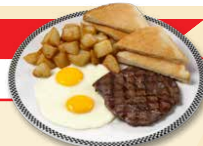
Steak & Eggs

THE ULTIMATE BREAKFAST 18.99 Two eggs, two pancakes or two French toast, two bacon strips, two sausage links plus ham, home fries & three slices of Texas toast