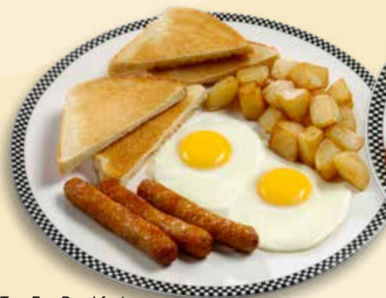
Two Egg Breakfast