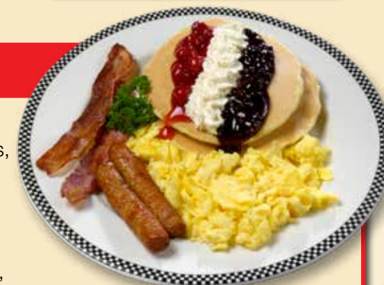
Johnny's Deluxe Combo

JOHNNY'S DELUXE COMBO 17.99 Two pancakes or two French toast, two eggs, two bacon strips & two sausage links. Pancakes or French toast topped with choice of two fruit toppings & whipped cream