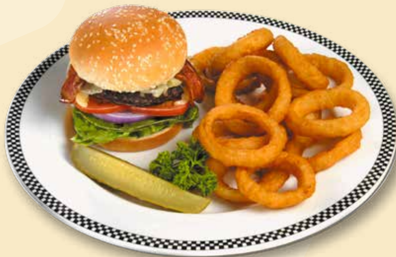
Bacon & Swiss Burger

JOHNNY'S BREAKFAST WRAP 13.99 Scrambled eggs with sausage & Cheddar cheese