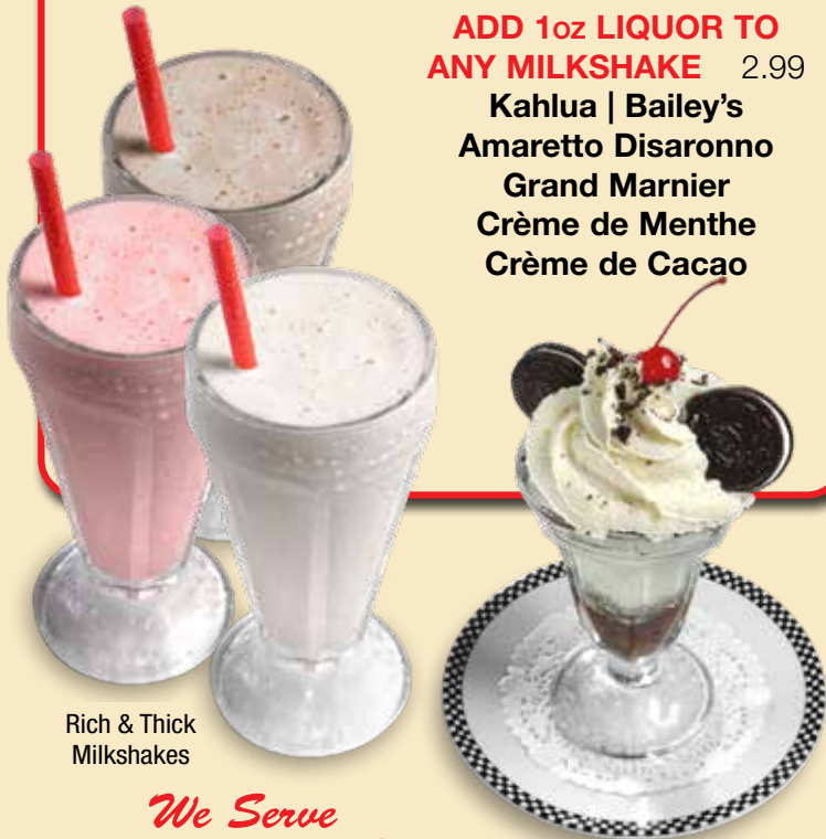
Rich & Thick Milkshakes

Kahlua | Bailey's Amaretto Disaronno Grand Marnier Crème de Menthe Crème de Cacao