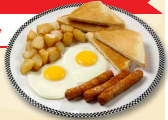
Two Egg Breakfast

Substitute Texas toast for Rideau Bakery rye, bagel, English muffin .99¢ or gluten-free toast 1.99. Choice of meat: three bacon strips or three sausage links or ham