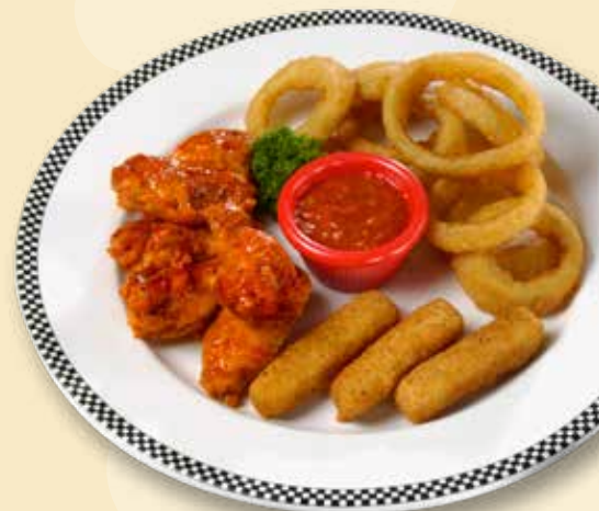
Johnny's Combo #1

CHICKEN FINGERS 11.99 Served with choice of sweet n' sour, plum or B.B.Q. sauce