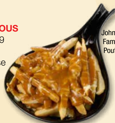
Johnny's Famous Poutine

JOHNNY'S FAMOUS POUTINE 10.99 Golden fries, St. Albert's cheese curds & Johnny's famous gravy