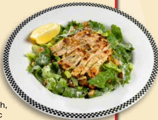
Chicken Caesar Salad

Dressings Available: Creamy Garlic, Italian, Ranch, Thousand Island & Balsamic Add grilled chicken breast 4.99 Add smoked salmon 5.99