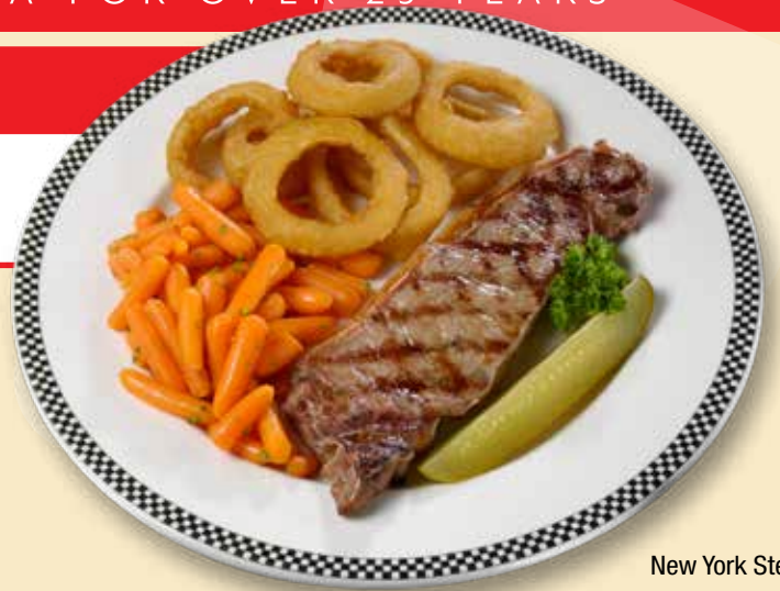
New York Steak

Served with choice of fries, onion rings, mashed potatoes or seasoned rice. Upgrade to sweet potato fries 2.79, garden salad 2.59, or poutine 3.99