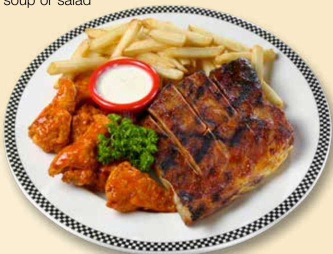
Ribs 'n Wings Combo

A delectable combination of seasoned ground beef topped with mashed potatoes with corn & Johnny's gravy. This dinner favourite is served with choice of soup or salad