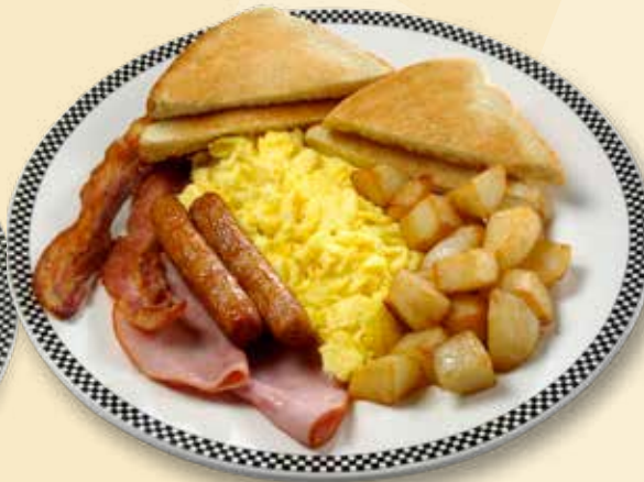
Big Man Breakfast