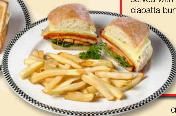
Chicken Parmesan Sandwich