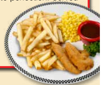
Senior Chicken Fingers Dinner

B.B.Q. RIBS 15.99 A quarter rack of B.B.Q. pork ribs slow cooked to perfection. Served with fries