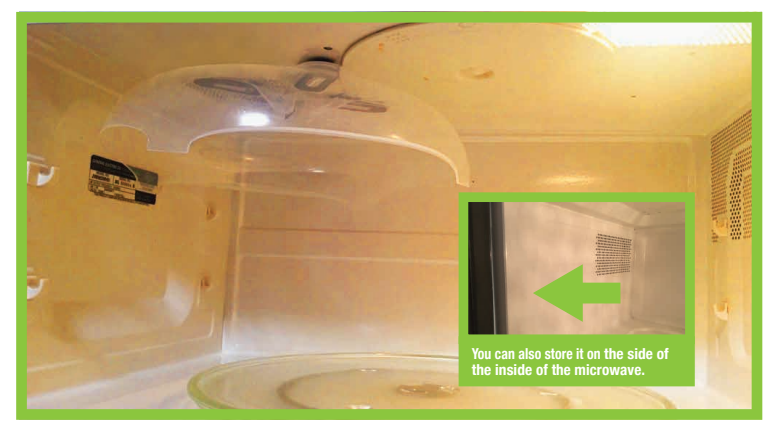
OTHER WAYS TO STORE YOUR HOVER COVER™ If your microwave has a plastic disc located on the top of the inside of the microwave, then you will need to offset your Hover Cover™ Microwave Splatter Cover to store.