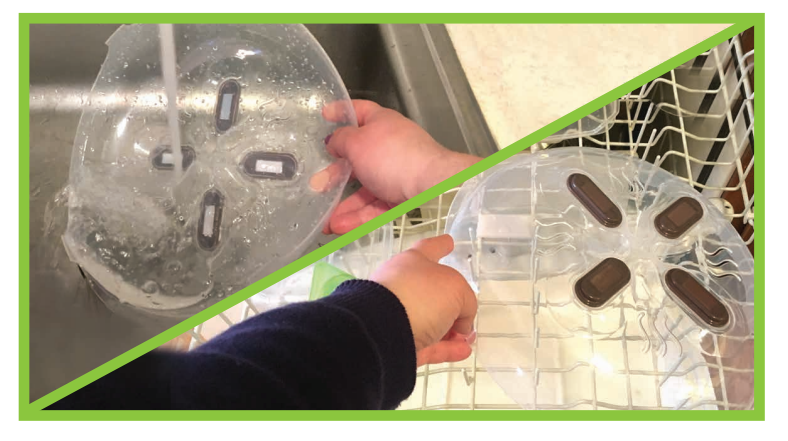
CLEANING THE HOVER COVER™ MICROWAVE SPLATTER COVER: Hover Cover™ Microwave Splatter Cover can be cleaned by hand with warm soapy water and a sponge. Rinse thoroughly and ensure product is completely dry before using again. The Hover Cover™ Microwave Splatter Cover can also be washed in the top rack of the dishwasher.

Carefully lift the Hover Cover<sup>™</sup> Microwave Splatter Cover until the magnets stick to the top of the microwave. Ensure the Hover Cover<sup>™</sup> Microwave Splatter Cover is well-adhered before removing your hand from the cover. CAUTION: Steam can burn. Use care when handling the Hover Cover<sup>™</sup> Microwave Splatter Cover and container. Remove the microwave-safe container from the microwave.