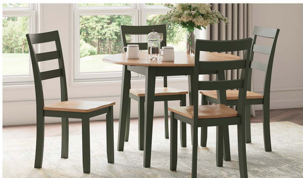
STANDARD HEIGHT ROUND DROP LEAF 42"W x 42"D x 31"H