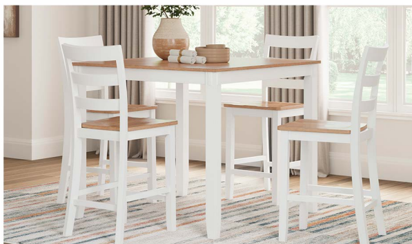
COUNTER HEIGHT SQUARE 42"W x 42"D x 36"H

2 Choose base color - Brown, White, Green or Blue ... all have Natural Mango Finish Top