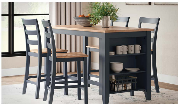
COUNTER HEIGHT ISLAND 60"W x 30"D x 36"H