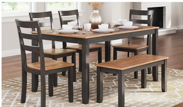
STANDARD HEIGHT RECTANGLE 36"W x 60"D x 30"H