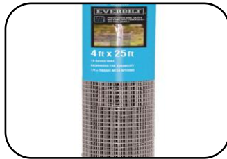
Half inch hardware cloth