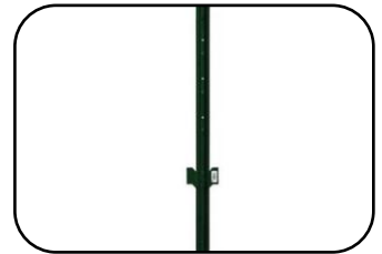
Heavy duty fence u-post