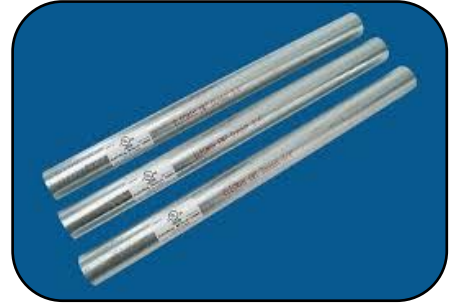
1/2" x 10' EMT tubing