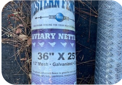
1/2 inch aviary wire was approved end of 2020. This is transparent, but stronger than bird netting