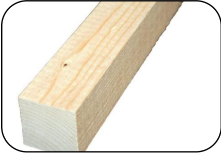
2 x 2 support pole untreated wood