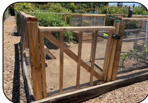
Hardware cloth ( 1/2 or 1/4 inch ) and wood sub structure