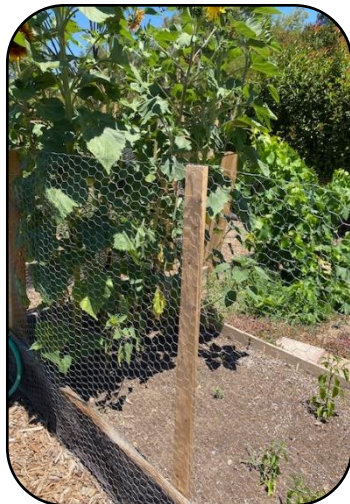
Chicken wire and pole supports