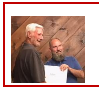
Walt McKenzie Commendation Award