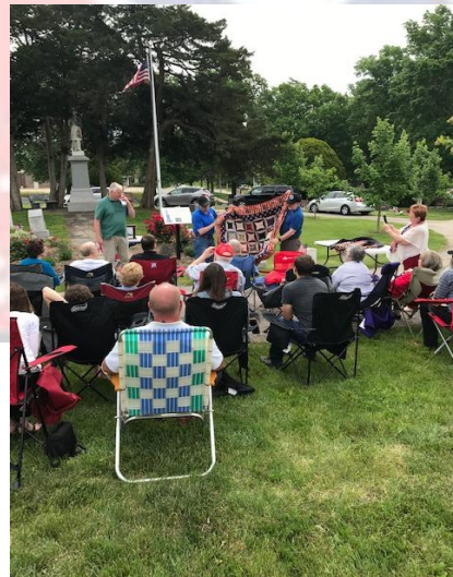
Assembled guests at the service