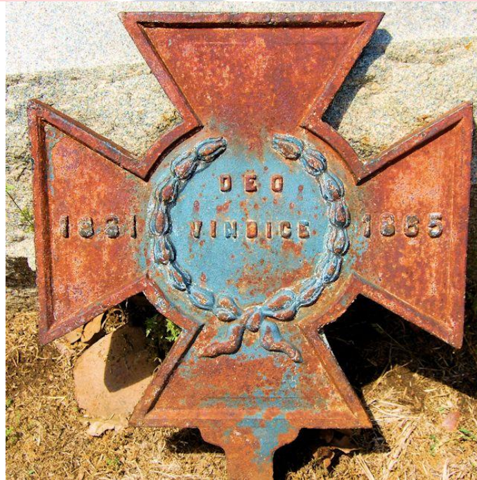
The Confederate Iron Cross of Honor

“Deo Vindice”, meaning “Under God, Our Vindicator” was the motto of the Confederacy.