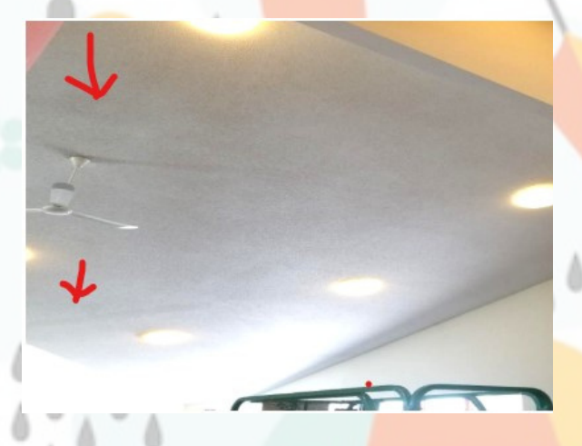
Current status - sheetrock hung, taping and mudding has started.

During construction, after the sheetrock has been removed.