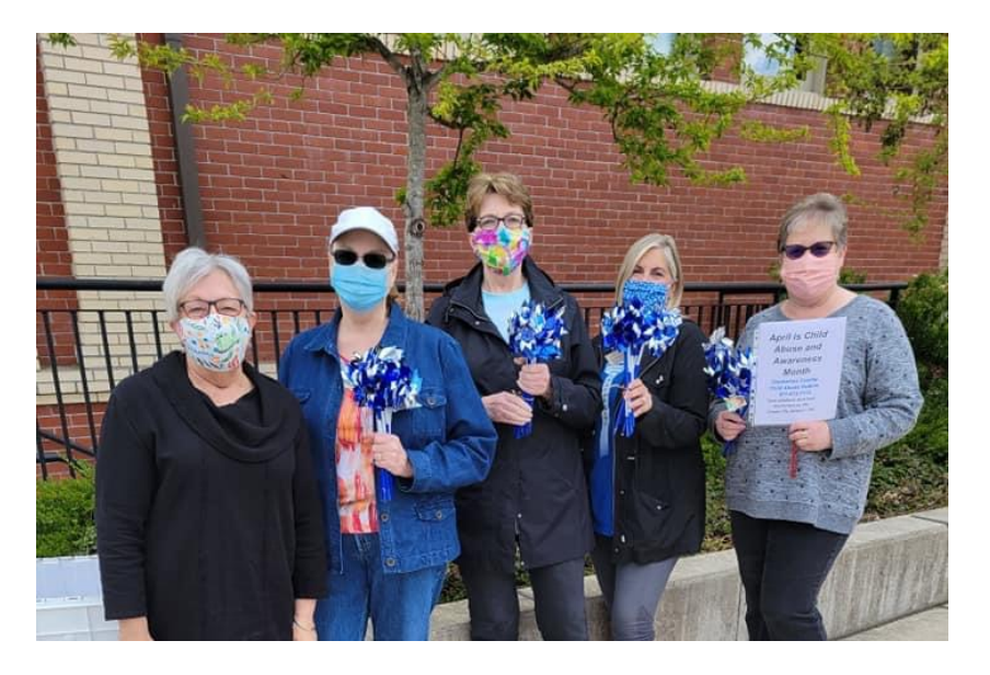
OCWC members placed blue pinwheels around the Oregon City Library to honor Child Abuse Prevention Month