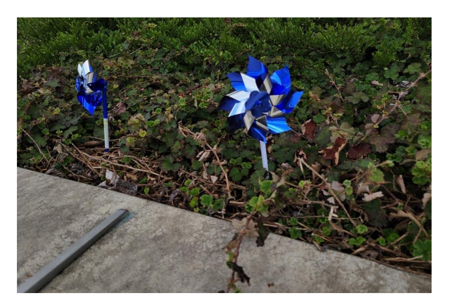
Child Abuse Prevention Month