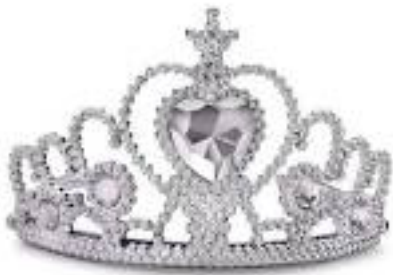
Real Queens fix each other's crowns.

Enjoy the remainder of summer! I look forward to seeing you all in September!