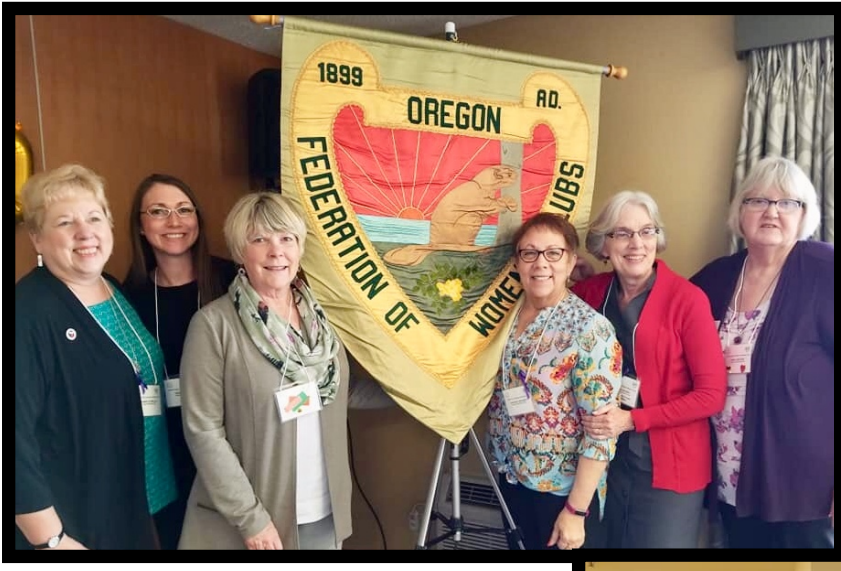
Attending the 104th OFWC Convention in Hood River