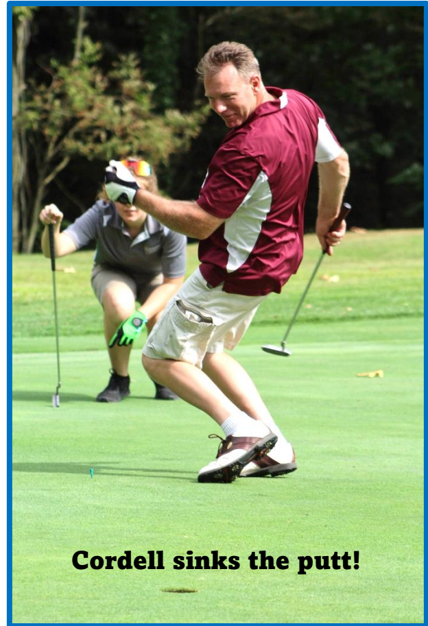
Cordell sinks the putt!

Frederick's Meat Market – meal The Teeter Group - snacks Heller's Gas & Fireplace Spring Cove Container