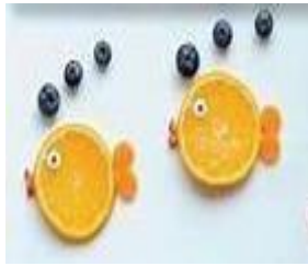
Orange and blueberry Fish