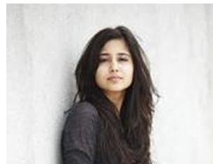
'I am greedy as an actor' 15/08/2015