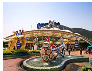
Come to visit the marine-life theme park in Hong Kong. Discover Hong Kong