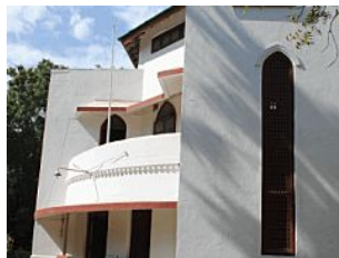
4 reasons you should get a Home Loan Bajaj Finserv