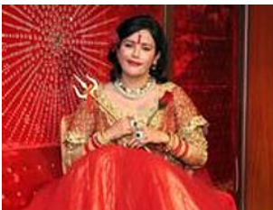
'I am not god, I am Radhe Maa' 16/08/2015