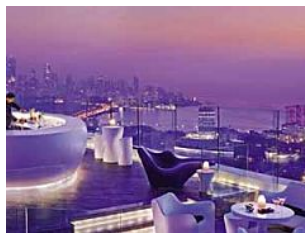
Best places in Mumbai to unwind and relax! LiveInStyle.com