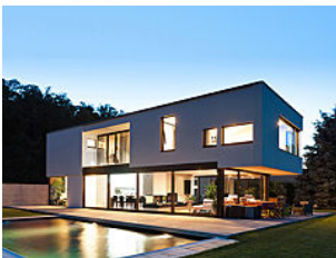
Did you know there are 5 types of Home Loans? Bajaj Finserv