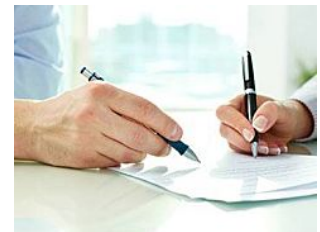
How EMI is calculated? Bajaj Finserv