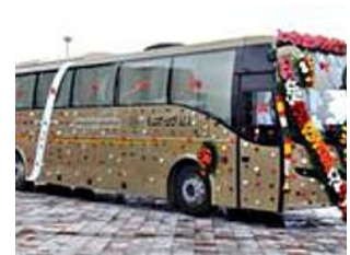
Flybus service to Coimbatore from KIA soon 20/08/2015