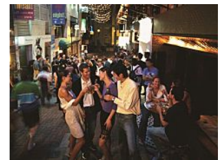
Your insider guide to discover the sleepless Hong Kong. Discover Hong Kong