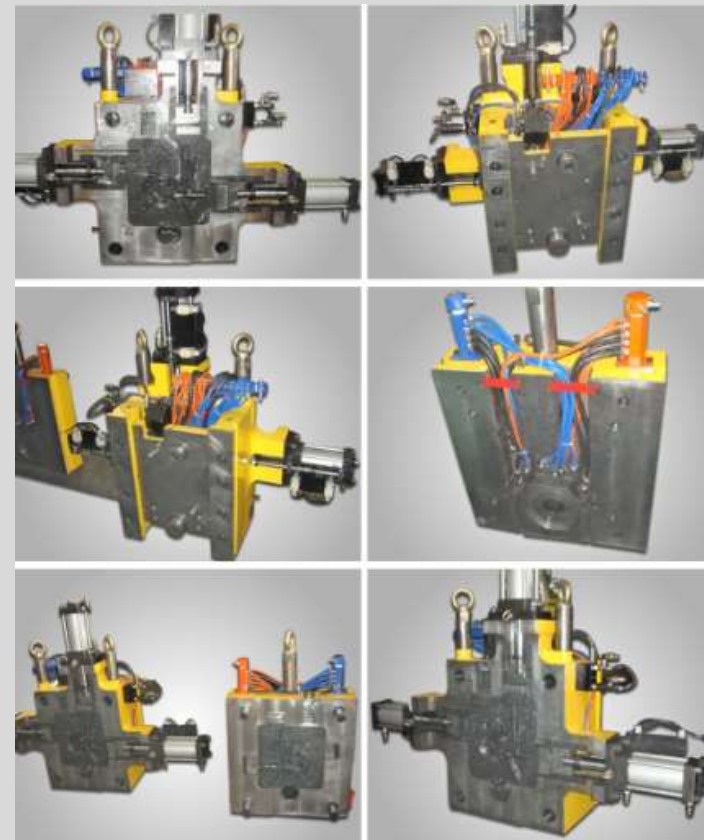
The toolings for zinc alloy

Life span of tooling: up to 80,000 shots (average) - 150,000 shots (Extra durable)