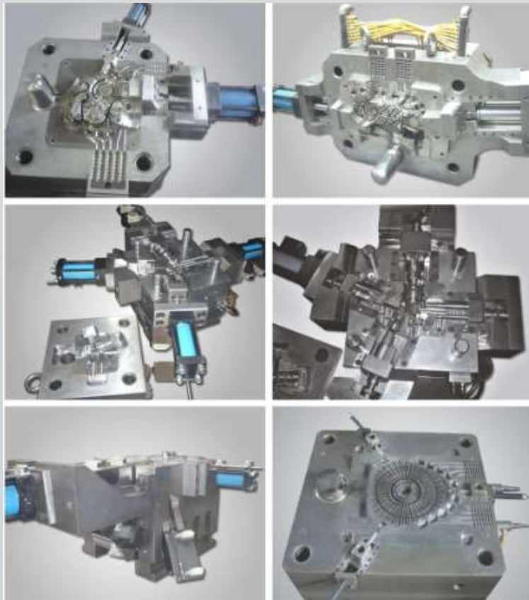
The toolings for aluminum alloy

Life span of tooling: up to 80,000 shots (average) - 150,000 shots (Extra durable)