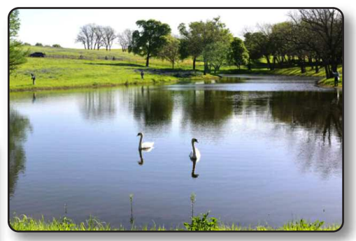
They have stocked some Swans. I have not seen unfenced white swans since I was in Europe. They are so graceful and beautiful. They can be feisty, but the ones on the Gannon Ranch are calm and just a (Continued on page 9)