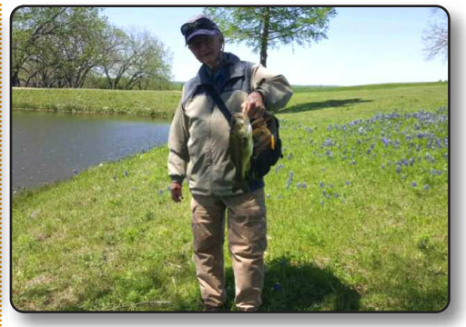
So if you have not been going to this outing, the next one is April 9th, 2022. Don't miss it. It is a signup outing, and so if you signup and cannot go PLEASE do NOT forget to cancel your commitment.

This last photo is my fly tying buddy, whom I had not seen much of since last March when the new nasty bug shut down everything we loved to do.