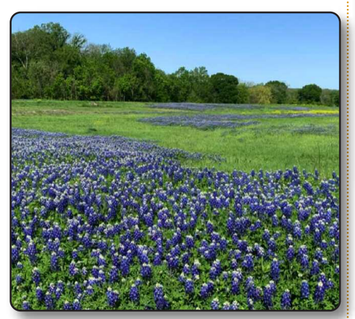
This is what I love the best. A Jillion acres of unspoiled wildflowers.

bit "Keep to themselves", so no attitude issues cropped up that I knew of.