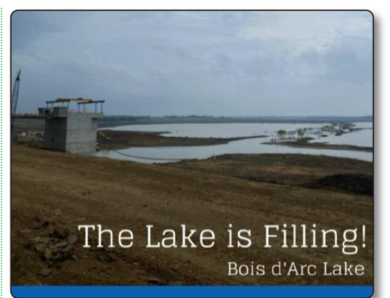
Here is a ground level shot from the Dam. It is little more than a puddle but give it a good wet season.

While we are on the subject of new fishing spots, the new lake in Fannin County is filling. The dam is closed, and if we DO finally get our spring rains, it will get a lot bigger.