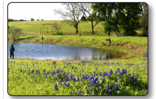
It is hard to say what I like best. The ponds, the fun fishing or the great wildflowers.