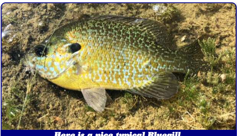
Here is a nice typical Bluegill.

Editor's Note: This outing began last spring when our need to get out and flog the water was getting so frustrated by the rules about gatherings. We went here and it was great, so we scheduled this fall outing. Now it looks to become a twice a year tradition, for which your Editor is glad. Here are some pictures.