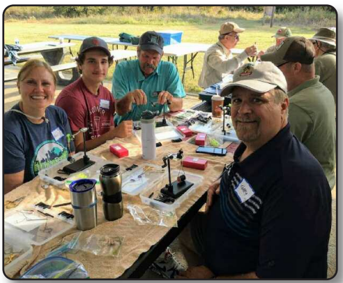
The Fly Tiers bending feathers.