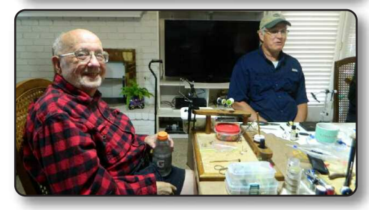
This is a great group of creative feather benders.

The next day was our Water Watch Stream Team monitoring of the exotic new Park along the Blue Line Bike Trail. We of the DFF do the bug picking and identification and two Master Naturalists do the Chemistry Lab work on the water quality. Here are some pictures.