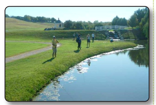
And when they were done, they de-rigged and put the rods and reels away like a good Fly Fisher.