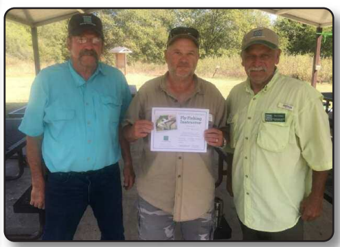
Here are our new Area Chiefs with one of their first new Instructors. Great job Gentlemen.