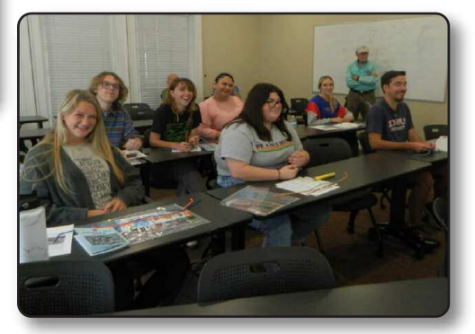
The group getting into knots. A lot of happy campers here.

The energetic class had fun, and here are a couple of examples.