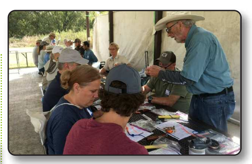
Going nuts over knots. Lots of fun.

After all that, I am ready to hope that we are getting the outdoor world going again. Wouldn't that be great? More fishing outings seem to be in our future.