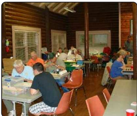
Here is a great picture of the multitudes in the fly tying room/Dining Room.