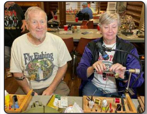
No tying event is complete without Spanglers.