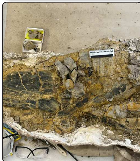
Bones from the Tylosaurus find in the bed of the North Sulphur River

A recent Fannin County fossil find of a Tylosaurus in July, on a section of the North Sulphur River owned by Upper Trinity Regional Water District (UTRWD), continues to tell paleontologists a story written approximately 100 million years ago, when much of Texas was covered by a huge inland sea.