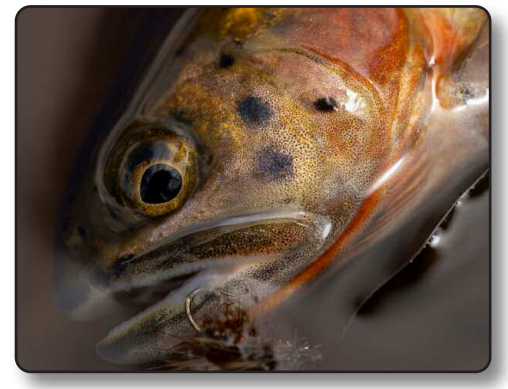
So what's it going to be?

But the truth of the matter is that in some places—not all, but some, throughout the country—a race to experience "how many" is a conservation concern. Or it should be seen as such. Because we can plant all the trees, fix all the bad culverts, advocate to remove dams, and all that good stuff, and if all anglers do is show up with the notion that pounding the living snot out of as many fish as possible is how to define success, none of the good mojo matters.