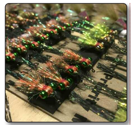
These events are hoping to build an attendance base for the 2nd and last Tuesday of the month. This session's attendance was about 16.