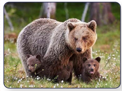
Brown bear with cubs