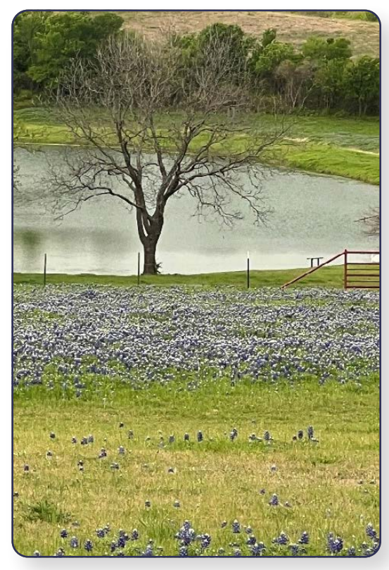
Pond at Sunset Ridge Ranch

The Bluebonnet Festival in Ennis is this same weekend so visit town after fishing for additional entertainment.