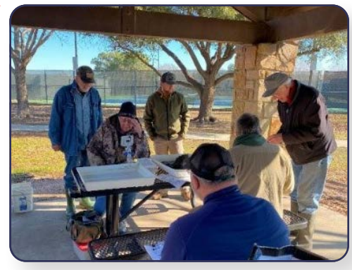
The bugs team

It seemed at first that our collection was small, but as the water in the pans warmed up, we found more and more specimens. At the end of the day, we were just about where we usually are in terms of numbers. Furneaux Creek was as clear as I have ever seen it. That, and the diversity of aquatic insects we found, attest to the stream's health