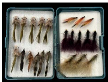
Fenwick Aetos Fly Box Fly Rod

Full Day Guided Fly Fishing with Wolf Creek Anglers for 1 or 2 Anglers and other Guided Trips