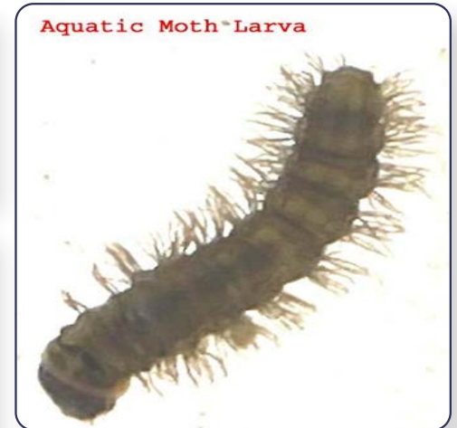
Aquatic Moth Larva