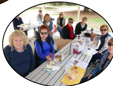
A walk and lunch at Kurnell