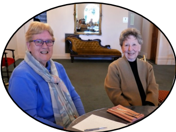
A lunch on Gardens on Forest