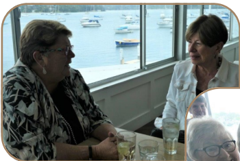
Our lunch at Royal Motor Yacht Club, Burraneer , on 3rd December.....

And our final get together for 2020, a year that will surely go down in history!