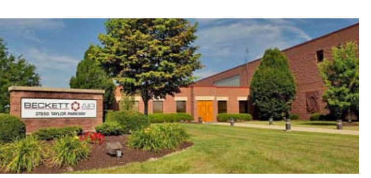
Beckett Air Inc.