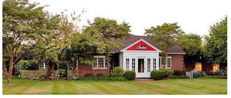
RW Beckett Corp.