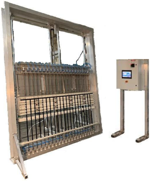
SWEDGEMASTER 4000 SL