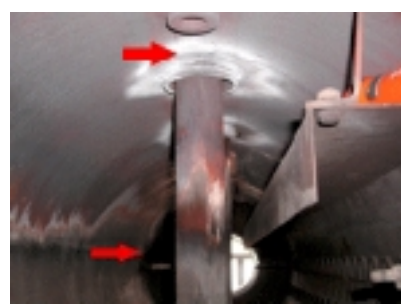
Figure 1. General location of cracks

Operators of D-Type boilers should conduct an inspection of the weld areas in the steam drum of these boilers in particular, as soon