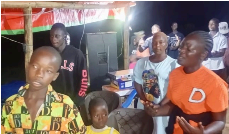
A celebration was held to dedicate the new shelter