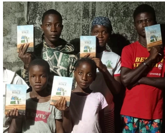
200 Bibles were purchased by LIG to distribute among the children from the four branches of BTO. Most of the kids had no access to the Scriptures before now, and were excited to have a Bible of their very own. Also, six cartons of Bibles and New Testaments of various translations have been shipped from North Dakota for general distribution