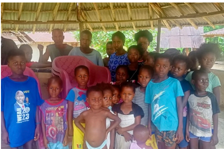
Chairs were purchased for BTO groups at Soul Clinic, Buchanan, and Frank Town, Liberia