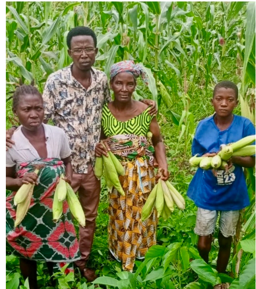
Children from BTO help on the farm with weeding & with harvest