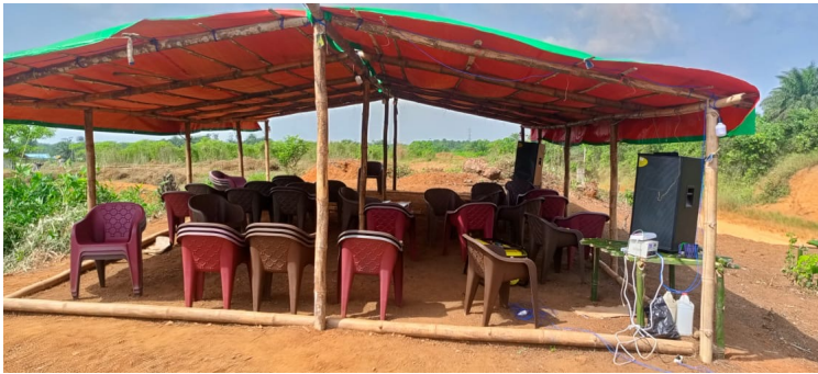
LIG constructed a shelter on the farm near Frank Town/ Careysburg as a meeting place for Bible Talk Organization. Shown are the new chairs and sound equipment. Not shown is the generator that is used for multiple purposes.

From page one . . . Youth Group is Major focus of LIG