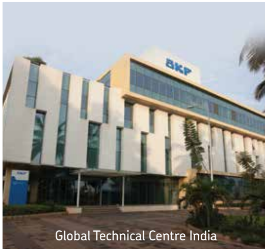
Global Technical Centre India