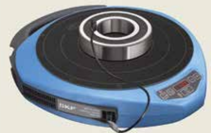
Portable induction heaters

HELP YOUR BEARING ACHIEVE ITS MAXIMUM SERVICE LIFE