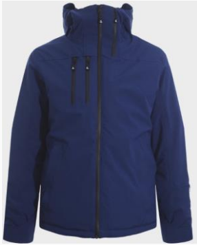
New Team Jacket

Purchase at Winter Sports Night Apparel Table or Online