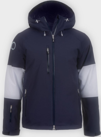
New Team Jacket