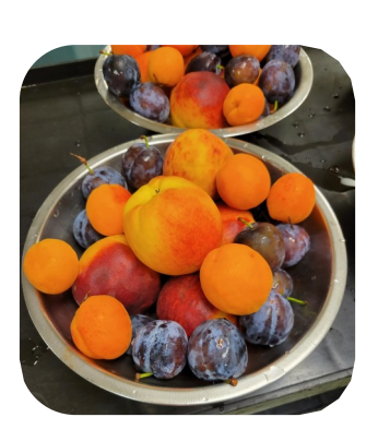
Seasonal LOCAL Fruit Available On The Nutrition Carts