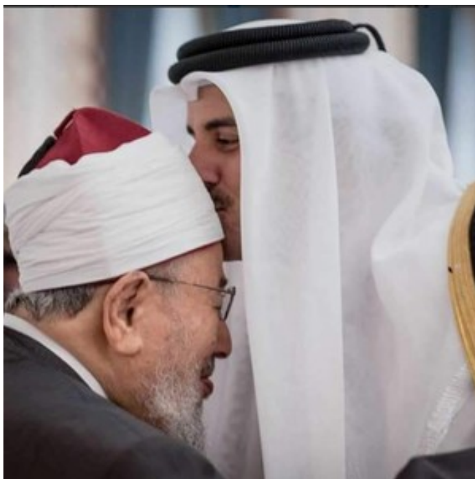
The Qatari emir has recently greeted a senior Egyptian cleric and kissed his turban

alliance countering nationalist and leftist movements, to a political and media partnership, and finally to a utilitarian relationship governed by regional power balances and Gulf-system pressures, with Doha carefully seeking to maximize its role while avoiding the cost of a complete rupture with its Brotherhood allies.