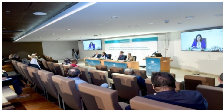
The Arab Center for Research and Policy Studies during one of the seminars

The "intellectual and research tool" represents one of the most important means Qatar has relied upon to reshape the image of the Muslim Brotherhood and market it internationally. While traditional powers usually focus on financial or military support, Doha invested in "meaning-making" through a systematic process of "rationalizing" the Brotherhood's discourse. According to analyses by the Washington Institute for Near East Policy, this process aims to present the Brotherhood to the international community, and particularly to the West, as a mature and politically acceptable democratic alternative, capable of leading regional states beyond the zero-sum dichotomy that for decades confined the