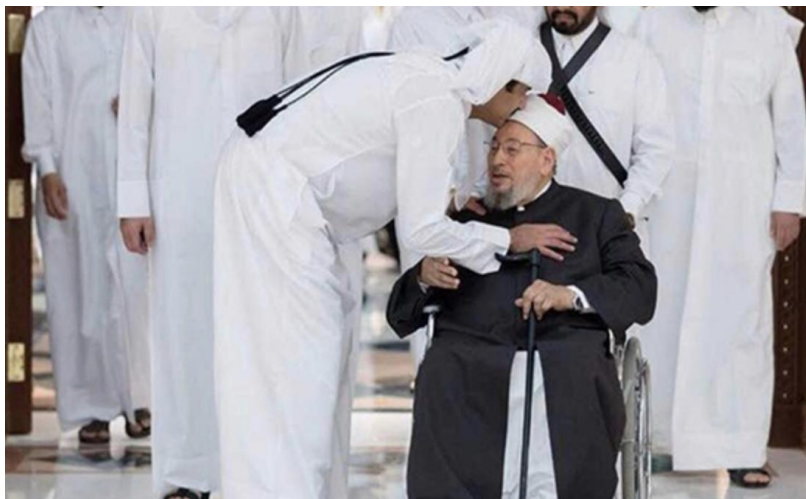
Qatari Emir Sheikh Tamim bin Hamad Al-Thani (Right) kisses Yusuf Al-Qaradawi

group from a spearhead of expansion into a carefully managed file within the framework of evolving international power balances.