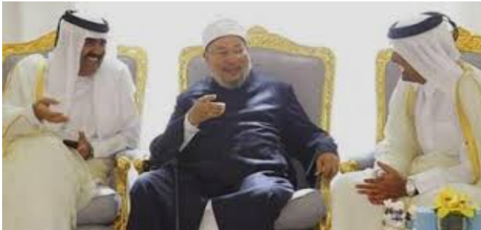
Yusuf al-Qaradawi between the former and current Emir of Qatar

During the tenure of Sheikh Hamad bin Khalifa Al Thani, Qatari foreign policy underwent a structural transformation, adopting a strategy academically described as “functional expansionism.” Since the 1995 coup, the new leadership sought to turn the country’s small geographic size from a security vulnerability into a platform for geopolitical maneuvering, based on the principle of “securing survival through amplified influence.” The primary challenge to this ambition was establishing a distinct political identity and an “ideological backing” that would grant Doha full independence from the traditional orientations of its regional neighbors. This objective prompted the transition of Qatar’s relationship with the Muslim Brotherhood from mere humanitarian hosting of