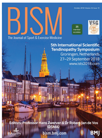
Figure 1 Cover from 2018.