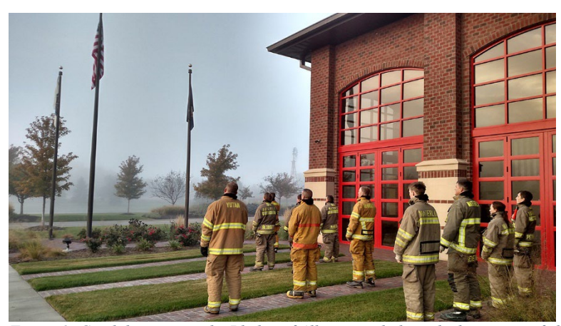
Figure 1: Candidates recite the Pledge of Allegiance daily at the beginning of class.