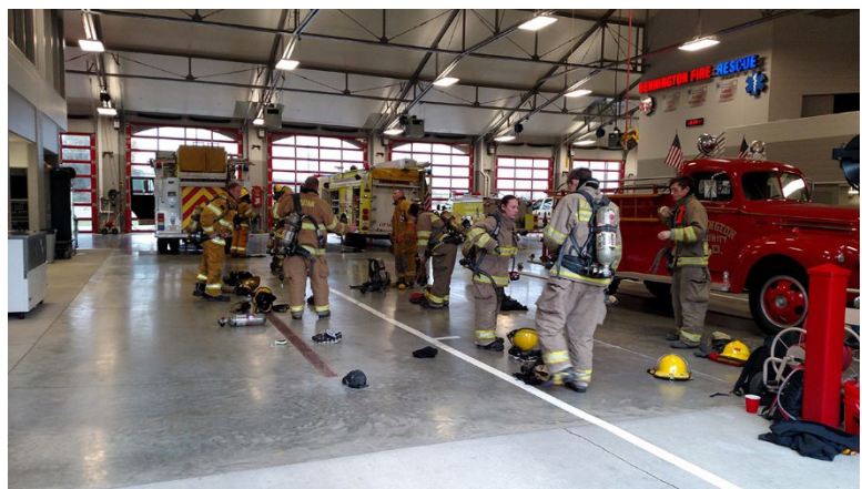
Figure 2: Recruits drill on PPE donning, first for accuracy, then for time.

7. Establish a daily and weekly routine for recruits to follow. For example: Be ready 15 minutes before class start. Have all PPE and SCBA checks complete prior to class start. Don't be the one who holds up class or their will be discipline. As the academy progresses, lump on additional responsibilities for equipment and apparatus checks <u>after</u> they are taught how by you. Checking apparatus and equipment before every class is an opportunity to provide training on policy, what to do with broken equipment, and it establishes "expectations" for acceptable work habits. At the end of <u>every</u> session, expect recruits to leave the station and equipment better than they found it. This is how good members are "built." Provide such expectations in writing at the beginning of the academy.