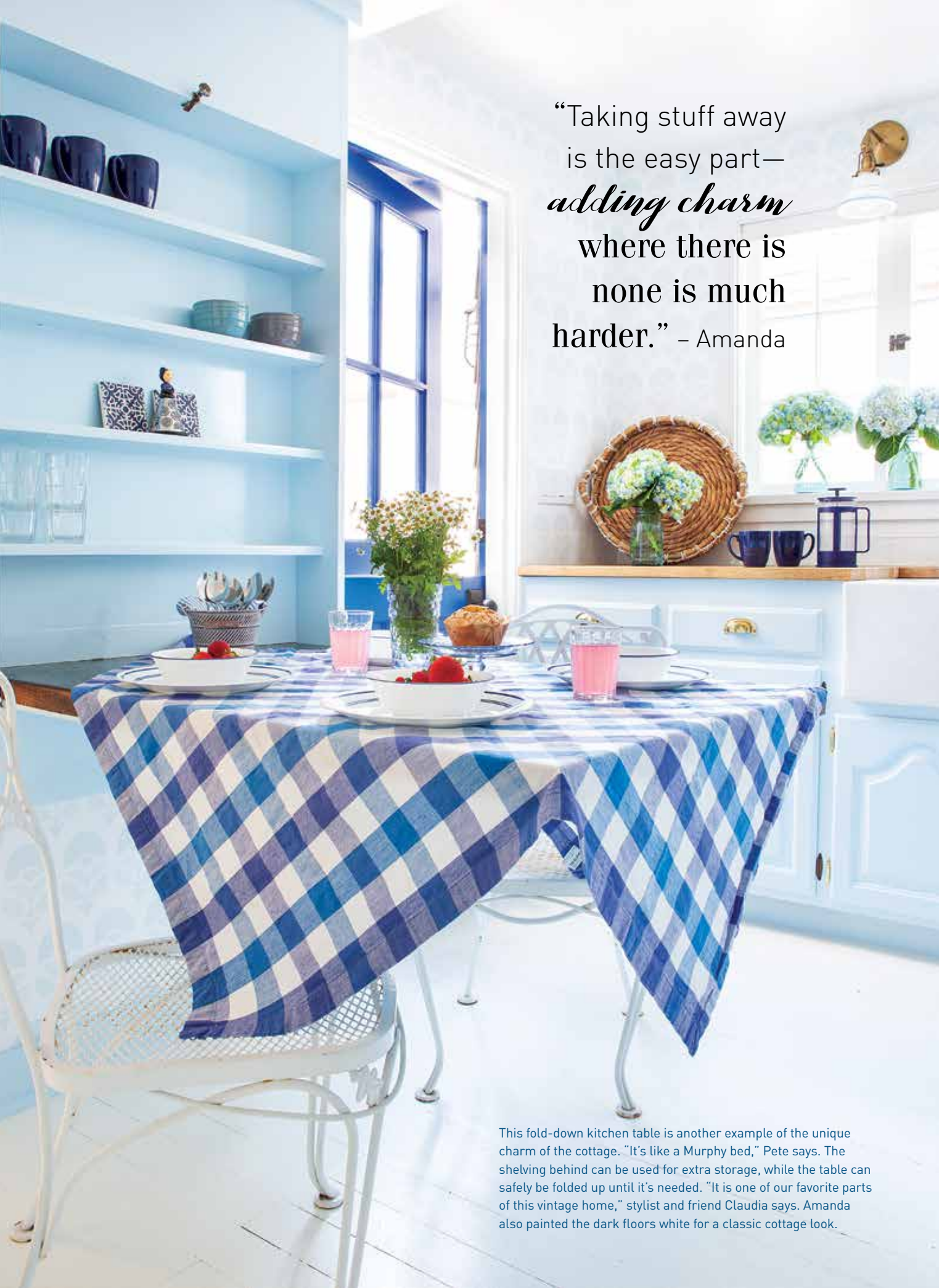
This fold-down kitchen table is another example of the unique charm of the cottage. “It’s like a Murphy bed,” Pete says. The shelving behind can be used for extra storage, while the table can safely be folded up until it’s needed. “It is one of our favorite parts of this vintage home,” stylist and friend Claudia says. Amanda also painted the dark floors white for a classic cottage look.

“Taking stuff away is the easy part— adding charm where there is none is much harder.” – Amanda