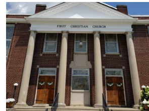
Irvine First Christian Church

https://irvine-first-christian-church.square.site/ When you go to this web site you will see the below picture. There will be a block where you can select the amount you want to send. The block says Tithe/Offerings