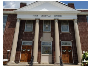
Irvine First Christian Church

https://irvine-first-christian-church.square.site/ When you go to this web site you will see the below picture. There will be a block where you can select the amount you want to send. The block says Tithe/Offerings