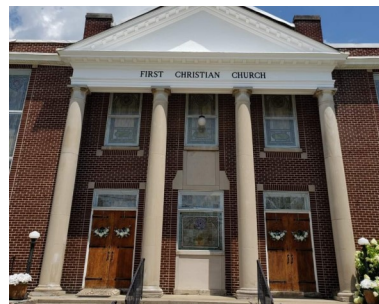
Irvine First Christian Church

https://irvine-first-christian-church.square.site/ When you go to this web site you will see the below picture. There will be a block where you can select the amount you want to send. The block says Tithe/Offerings