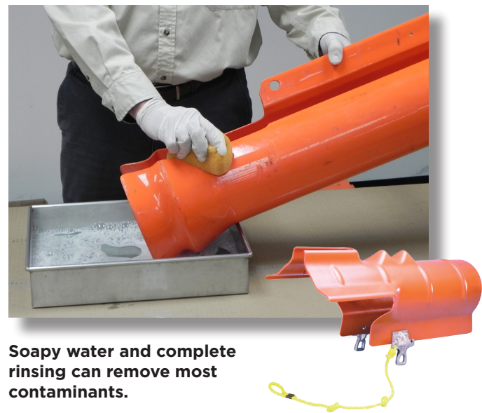
Soapy water and complete rinsing can remove most contaminants.