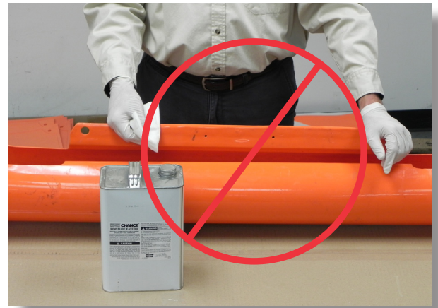
On cover-up made of ABS plastic, do not use Moisture Eater II cleaner. Too harsh a solvent will pick up the material's color on the cleaning pad.

Some electric utilities have established periodic retesting programs for their cover-up. New cover-up from CHANCE meets or exceeds industry electrical standards and can be placed into immediate service after initial inspection for shipping damage. After visual inspection, if the electrical integrity of a cover is in question, it should be tested at a prescribed withstand voltage according to its rating or discarded. ASTM standards F478 and F479 describe testing methods for rubber equipment while ASTM F712 deals with testing of rigid plastic covers. ASTM F479 also requires electrical retesting of in-service blankets at a maximum interval of every 12 months. If it is determined that a cover does not meet electrical requirements, it should be permanently marked or cut up so that it will not be placed back in service.