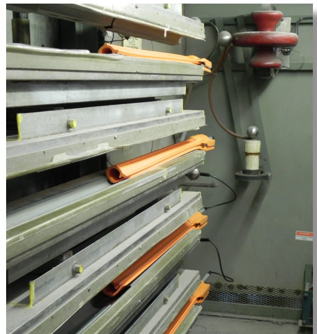
Electrically testing CHANCE cover-up prior to shipment.