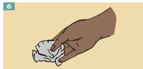
6 Dispose of the gloves safely. Do not reuse the gloves.