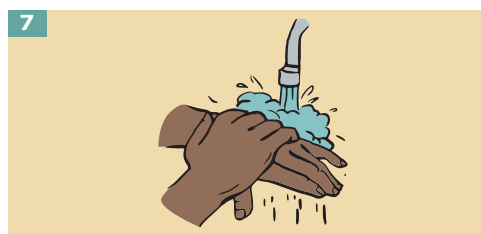
7 Clean your hands immediately after removing gloves.