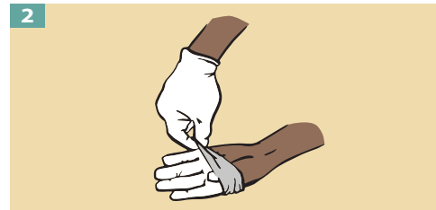
2 Peel the glove away from your body, pulling it inside out.