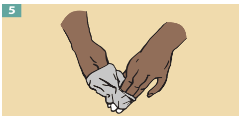
5 Turn the second glove inside out while pulling it away from your body, leaving the first glove inside the second.