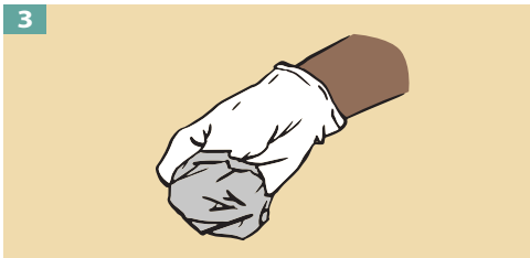
3 Hold the glove you just removed in your gloved hand.