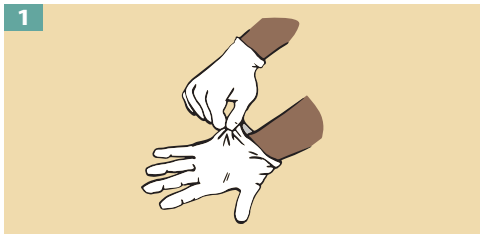
1 Grasp the outside of one glove at the wrist. Do not touch your bare skin.

To protect yourself, use the following steps to take off gloves