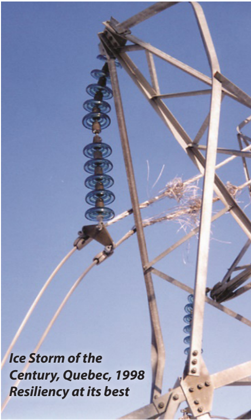
Ice Storm of the Century, Quebec, 1998 Resiliency at its best

current, humidity and temperature data. Units are now deployed on transmission lines around the world in highly contaminated areas to provide real-time analytics and early warning of potential flashover