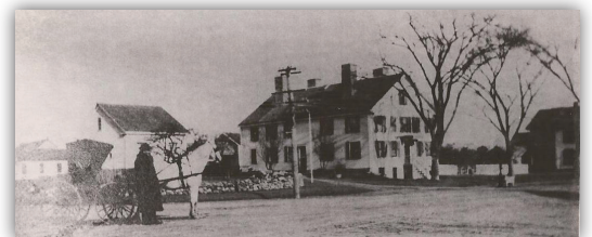
At the site of The Cushing Center today, the almshouse was a home for the poor and unfortunate of South Scituate

was a white man, a sea captain, and her mother a full-blooded Indian. She was brought up in [the Stockbridge family] one of the first families of the town of Scituate, and had, until within a year or two, lived in the family down to the fifth generation. Within that time she had been unable to support herself, and became an inmate of the almshouse. (continued on page 2)