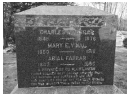
The Farrar gravestone at First Parish Church cemetery

One could imagine the scene of townspeople coming to