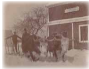
The article featured this undated photo of a team of oxen on Main Street in Norwell.

Thank you to the Mariner for its interesting and informative feature, and a reminder to members to renew on-line or via mail today.