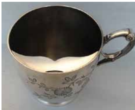
An antique silver mustache cup

Some mustaches of the early twentieth century could be quite glamorous and others quite bizarre. Among the styles were the “walrus,” the “handle bar,” the Van Dyke and the Fu Manchu. Many men took great care in coloring, curling and waxing their mustaches. However, this practice wasn’t compatible with coffee drinking. Consequently, some of the best known potters created mustache cups. This drinking cup, a