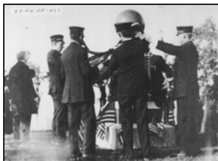
May 24, 1914--Dedication of the monument to the "unknown dead" in the Washington Street Cemetery.