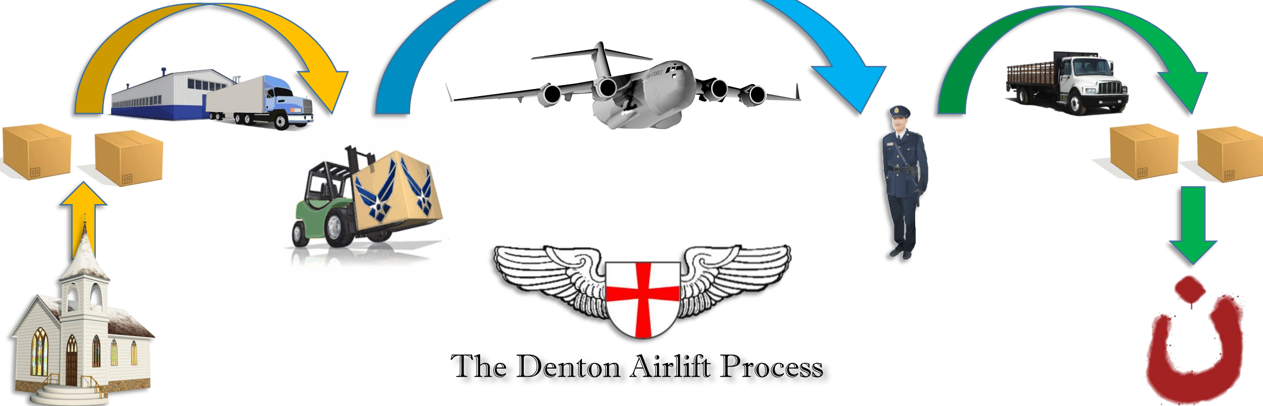
The Denton Airlift Process